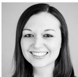
Beth Garden Marketing and Communications (co-opted)